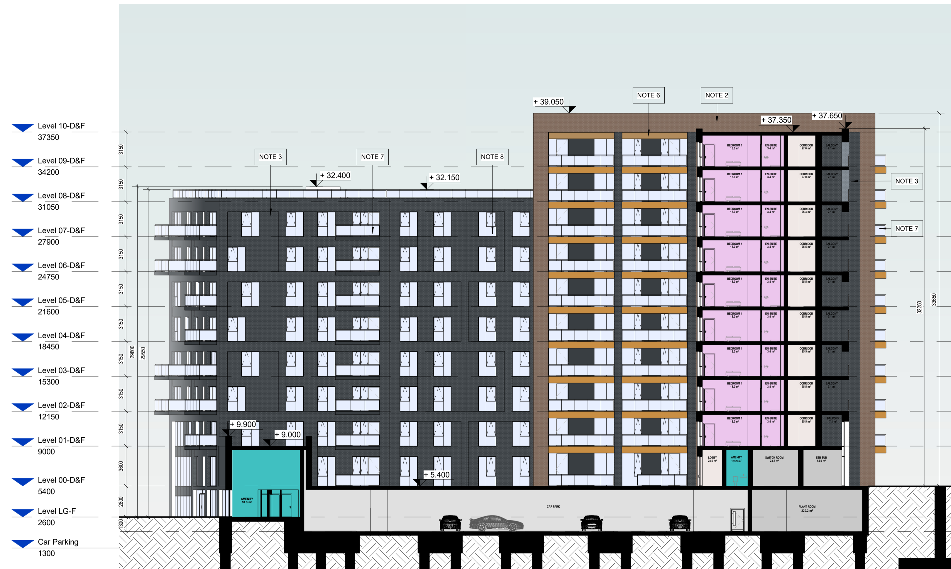
1 BLOCK F-SECTION D-D 1 : 200